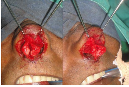
Fig 5 Lax lower alar cartilage splinted