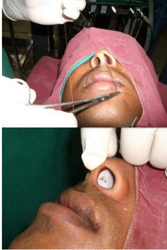
Fig 2 Teflon splints being sutured to the septum