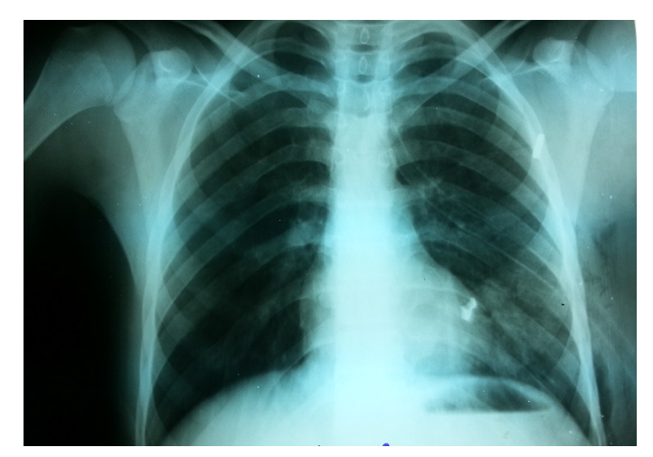
Figure 2. PA chest radiograph demonstrating shrapnel in left ventricle.

rapidly detected in four of the cases with 80% sensitivity (Figure 1). Chest radiographs were obtained for three patients with minimal diagnostic significance other than general shrapnel location (Figures 2 and 3).