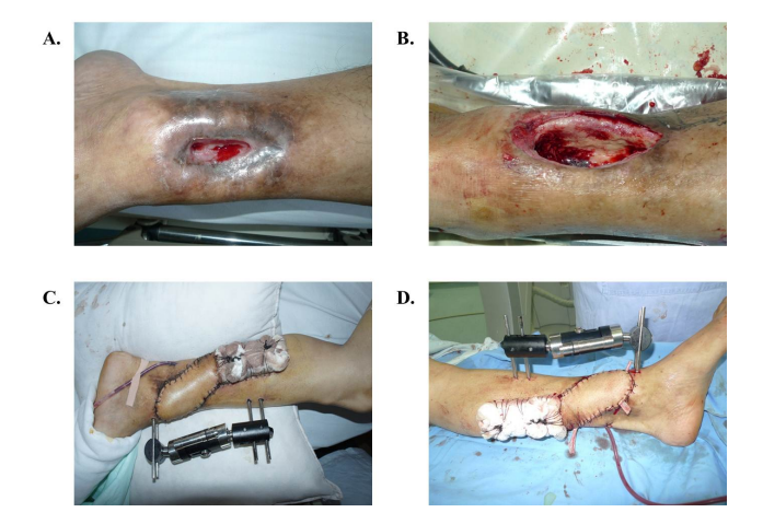
Figure 2. Typical images showing before (A), during (B), I week after (C) and 6 months after (D) surgical treatment for post-traumatic osteomyelitis of the tibia.

Different sites of soft tissue defects should be covered by different myocutaneous flaps: defects in distal tibia and near the ankles usually covered by perforator flaps of pulmonary artery and posterior tibial artery; defects in proximal tibia and near the knees often covered by medial and lateral head of