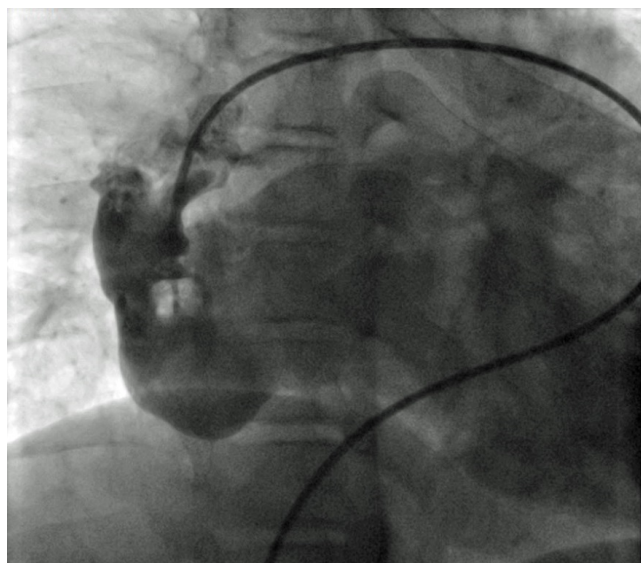
Figure 1. Right pulmonary artery angiogram demonstrating a large pulmonary arteriovenous malformation communicating with the right lower pulmonary vein.

between the right lower pulmonary artery and the right lower pulmonary vein (Figure 1).