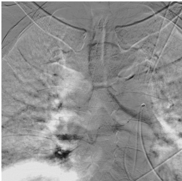
Figure 2. Super selectively avoid the dangerous anastomosis of arteriae intercostales and (or) spinal artery.

position was suspected to shift, to ensure the accuracy of perfusion vessels. Whole cerebral angiography showed 19 cases were supplied with the arteriae cerebri media, 10 cases with arteriae cerebri anterior and 4 cases with the both. The drug was perfused according to the size of the lesion, but the total amount of the brain was the same.