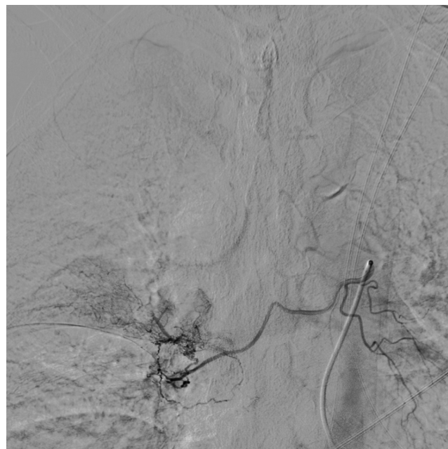
Figure 1. The bronchial artery or the relevant intercostal artery was chose for radiography.

the mesenteric artery of the abdominal aorta and 8 mg ondansetron was pushed in slowly. And then bilateral bronchial artery or the relevant intercostal artery was chose for radiography (Figure 1). Guided by SilverSpeed-14 (ev3, Plymouth, MN, USA), Echelon-10 45° micro catheter (ev3, Plymouth, MN, USA) can super-selectively avoid the dangerous anastomosis of arteriae intercostales and (or) spinal artery. After blood supply artery of the tumor was confirmed by micro catheter angiography (Figure 2), 20 ml normal saline or glucose diluted Etoposide (VP-16), THP, Cisplatin (CDDP) were perfused with 2 ml/min by high pressure syringe. The position of the catheter and its tip should be observed during the process of perfusion. Timely angiography should be done again if the position was suspected to shift, to ensure the accuracy of perfusion vessels. 4 cases were supplied with bilateral bronchial artery, 2 cases with arteriae intercostales. The drug was perfused according to the size of the lesion, but the total amount of the lung was the same.