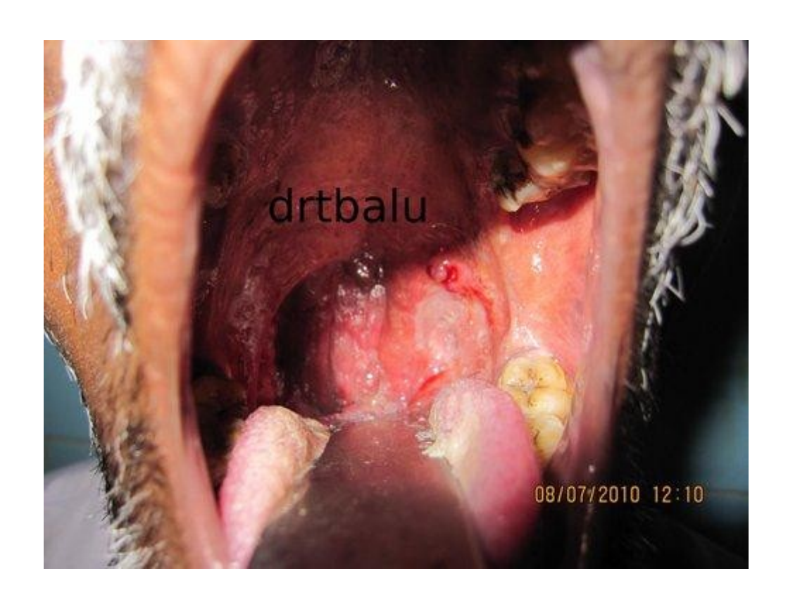
Photograph showing ulceration of left tonsil with erosion of both pillars