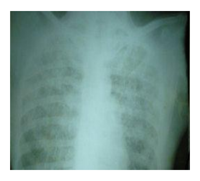
X-ray chest revealed Miliary mottling