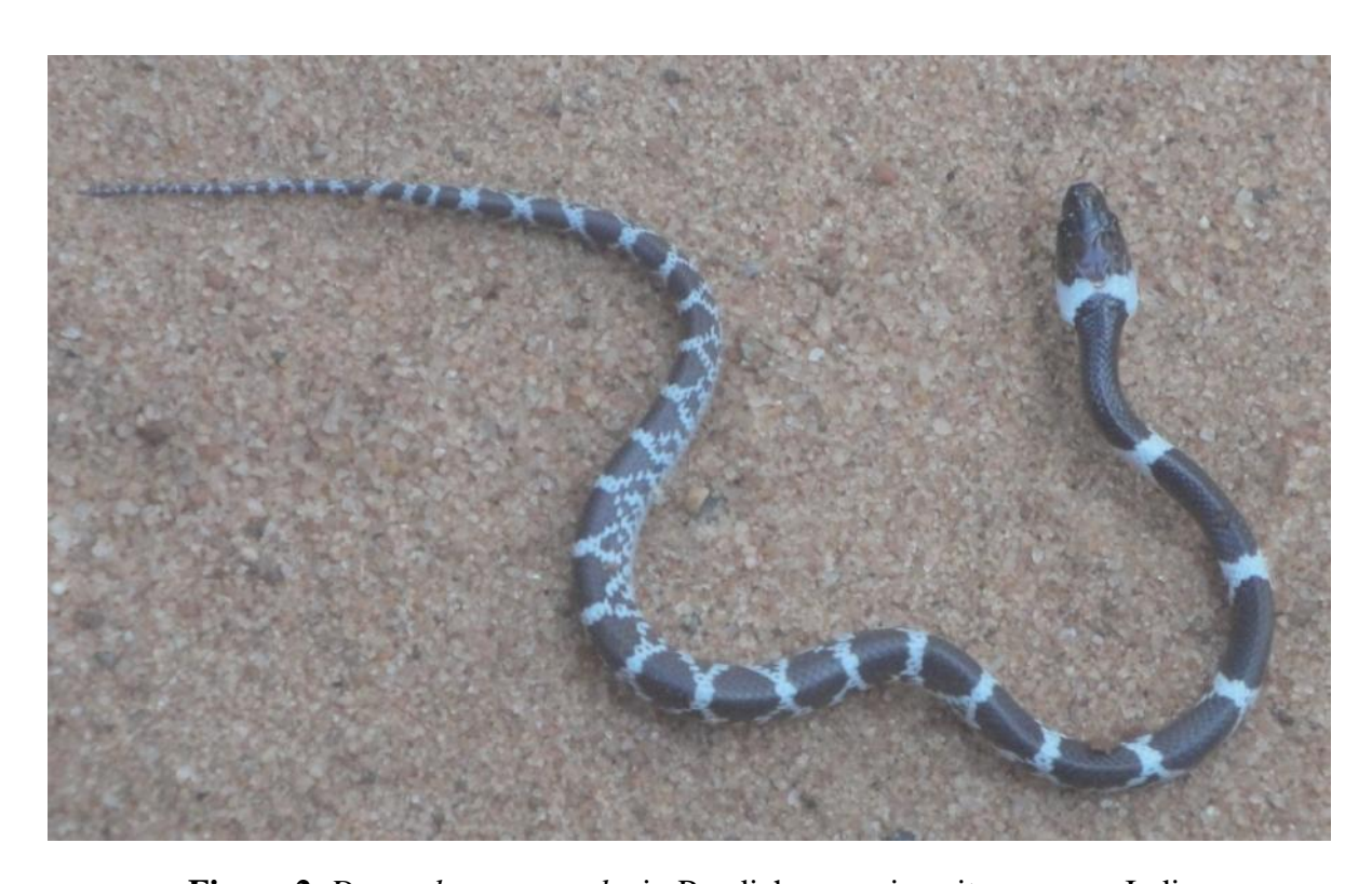
Figure 2. Dryocalamus nympha in Pondicherry university campus, India

D. nympha was observed in under bark and root of Tectona grandis and Acacia auriculiformis moon season at central during soon instrumentation facility building in Pondicherry University campus which is surrounded by lush vegetation (Figure 2). According to IUCN, D. nympha are uncommon in this region, are listed under not evaluated category (NE), and it is protected by wild life protection act under schedule IV, which is not reported by earlier studies. Hence, this study is confirmed that D. nympha is first reported from Puducherry region.