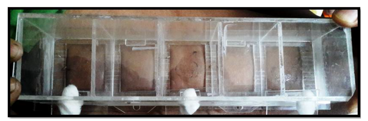
Figure 1: Repellent Activity of Different Essential Oils against Aedes albopictus Mosquito Using K & D Module.

Plenty of different techniques for mosquito vector control such as attractants, insecticides, repellents, biological environmental and genetics control etc. are in use which has their own merits and demerits. Hence it is essentially important to develop safe and eco-friendly techniques for the control of vector borne diseases especially in the field of mosquito. In rural communities, Plant-based repellents are still extensively used (Moore, 2006). At the latest, in market many commercial repellent products containing plant-based ingredients have gained increasing prominence between consumers because of their safe and non-toxic nature in comparison to popular trend of using synthetic repellents and reliable means of mosquito bite prevention (Isman, 1995).