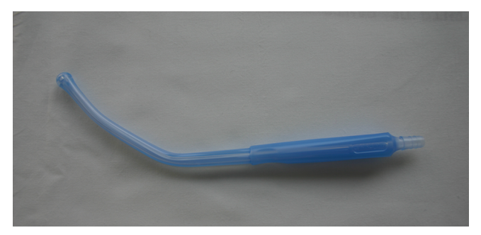
Figure 2: Rectal cannula.

before transfer to the endoscopy Unit where colonoscopy is carried out within one hour after completion of the cleansing procedure. To avoid formation of a bacterial biofilm in the internal circuit, a disinfection of the tubing with a light bleach solution (225 ml of 2.6% ac bleach) was enforced every day, followed by a thorough rinsing with water. Water was sampled 48 hours after each disinfection by the Hospital Hygiene Laboratory and cultured in accordance with standards enforced by the French legislation (NF ENISO6222, NFENISO16266) and NF ENISO9308-1). The external cleansing of the device was completed after each use with detergent and disinfectant products routinely in use in our hospital for non-critical surfaces (Aniosurf premium®, Laboratoires Anios®, Lille-Hellemmes, France) and validated at an European level (European standard tests EN 1040, EN 1276, EN 13727, EN 1275 and EN 1650).