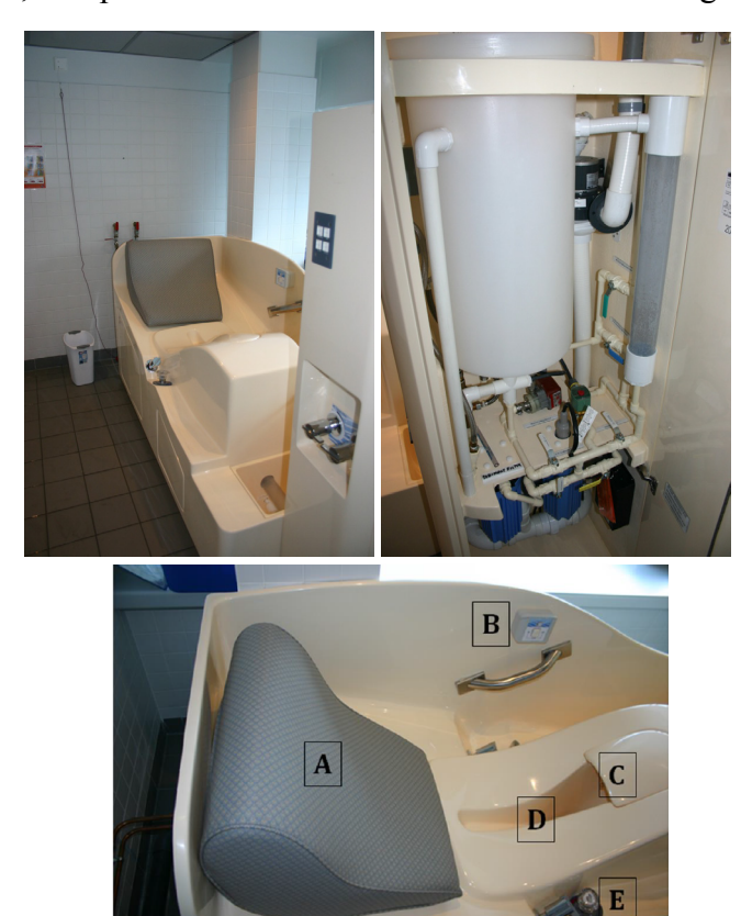
Figure 1: General view of the Angel of Water device used in the study (upper left panel). Inside view showing the water tank, the water circuitry and the filters (upper right panel). Patient seat (A) with an emergency switcher (B), the connection for the rectal cannula (C), the evacuation output (D) and the tap controlling the mixing supply of hot and cold water to the tank (E).

Patients with an indication of colonoscopy aged 18-80 years were included. Exclusion criteria were: history of colonic surgery, abdominal hernia, clinical suspicion of bowel obstruction or colonic stenosis, acute flare of inflammatory bowel disease, pregnancy, uncontrolled heart disease or renal insufficiency, weight >182 kg, known allergy or hypersensitivity to PEG. The study protocol was approved by the Regional Ethics Committee. Written informed consent was obtained from all patients. The trial was registered on Clinicaltrials. gov under NCT 01871584. The device for water infusion Angel of Water® (Lifestream, Austin, TX – FDA clearance K003720, June 27, 2002; CE-Mark 504677, May 22, 2006) is constituted of a 35L water tank maintained at 37°C by a heating system (Figure 1). Water is filtered through ionic and ultraviolet filters and infused by gravity through a single-use cannula, into the rectum (Figure 2) in 20-30 minutes. The patient sits on an adapted seat allowing easy passing of water and evacuation of feces, in a semi-reclined position. At the end of the procedure, the patient is asked to evacuate the remaining colonic content in the toilet,