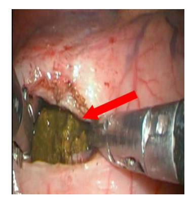
Figure 2. The bezoars were removed using grasp pliers and gallbladder pliers.

inserted on the right side symmetrically. A longitudinal incision was made in stomach antetheca. 3 large bezoars were observed in gastric body and pyloric tube. The bezoars were removed using grasp pliers (Johnson, China) and gallbladder pliers (Figure 2). A drainage tube was inserted to the pylorus and high pressure injection of saline was performed to determine whether there was obstruction or not. The incision of the stomach was closed using Endo-GIA (Tri-Staple, Covidien ltd., USA). Active bleeding was examined and the incisions were closed. The surgery time was 120 min with 50 ml blood lose. Postoperatively, the patient was prohibited from eating and drinking for 3 days. Five days postoperatively, gastric tube was removed and the patient was allowed to have a small amount of liquid diet. Six days postoperatively, the incisions healed well. The peritoneal drainage tube was removed and the patient was discharged in well general condition. Two months after the surgery, she was asymptomatic and recovered. The pathological examination suggested that it was fibrous bezoar.