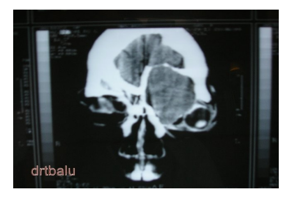
Coronal CT scan showing proptosis due to frontoethmoidal mucocele