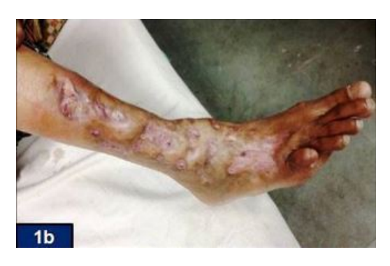
Figure 1b. Scarred lesions with multiple non-discharging sinuses and hammer toe deformity of the little toe on clinical examination.

Her laboratory investigations revealed microcytic hypochromic anemia with hemoglobin level of 10.2 gm/dl (MCV-70.6 fl), the peripheral blood leukocyte count was 13,000/ml with differential being of 80% neutrophils, the platelet count was 4,10,000/μl, the erythrocyte sedimentation rate was 60 cumm/hr and the c-reactive protein was 86 mg/l. Blood sugar, renal and liver function tests and urine as well as blood cultures were negative. Serological tests for hepatitis B and C antigen, human immunodeficiency virus was non-contributory. Montoux's test was negative. Other investigations like radiological evaluation of chest, spine, abdomen, pelvis was within normal limits. X-ray of the right leg and foot showed numerous soft tissue lesions without any involvement of the underlying bones. A deep tissue biopsy from these lesions was taken and sent for histopathological examination as well as microbiological culture. Microscopic haematoxylin and eosin stained sections showed hyperkeratosis and acanthosis of the epidermis of the skin. The dermis revealed bacterial colonies of actinomycetes surrounded by acute inflammatory infiltrate comprising predominantly of neutrophils (Figure 2). Gram staining and Periodic acid-Schiff staining also showed actinomycotic colonies while staining for acid fast bacilli was negative, hence confirming the diagnosis of actinomycosis.