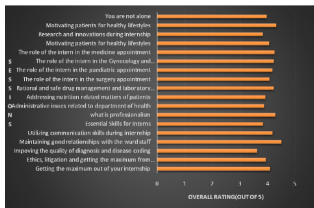
Figure 2: Sessions feedback statistics for Good Medical Practice.

Department of Health” and “You are not alone” were also particularly well received. Overall, 11 out of the 18 sessions received cumulative ratings of 4 and above. The results are summarised in (Figure 2).