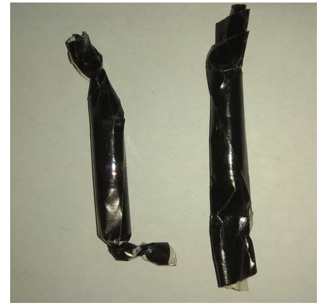
Figure 1. Commercially available silver nitrate stick.

We have modified the technique of application of silver nitrate to achieve desirable results. The addition of distilled water to