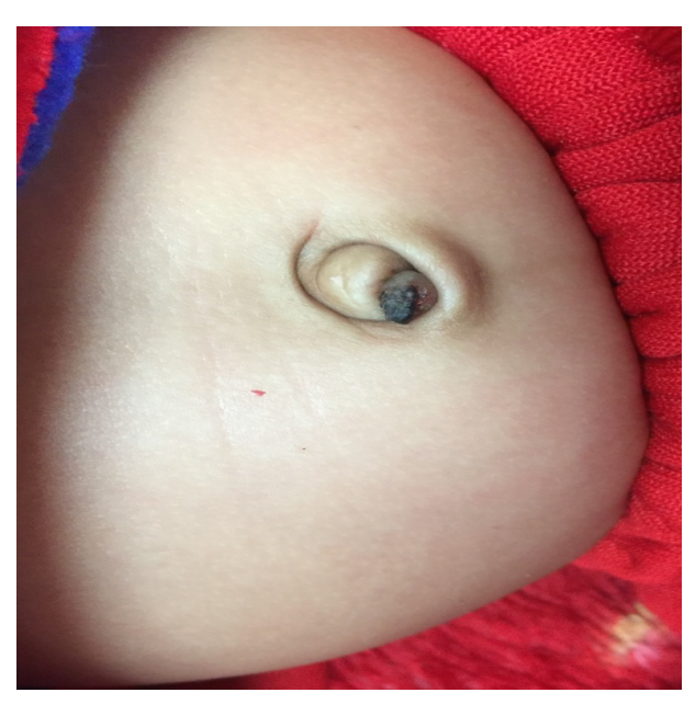
Figure 3b. Black eschar 24 hours after application of silver nitrate.

the powdered silver nitrate allows pre-activation of silver nitrate into Ag+ ions thus enabling its cauterizing and antiseptic effect. The pre-activation allows silver nitrate to act faster as compared to the standard technique of application of silver nitrate stick directly to the lesion. The surrounding skin was rinsed/cleaned with normal saline which neutralizes the silver nitrate, thus preventing surrounding burn. Rinsing with normal saline is superior to the standard technique of application of vaseline in the surrounding. This is because in presence of NaCl, The silver ions get inactivated. It is of utmost importance not to rinse the affected area with normal saline prior to the procedure. This simple yet effective method not only simplifies the ease of application but also prevents post application burns. The results achieved are safe and encouraging.