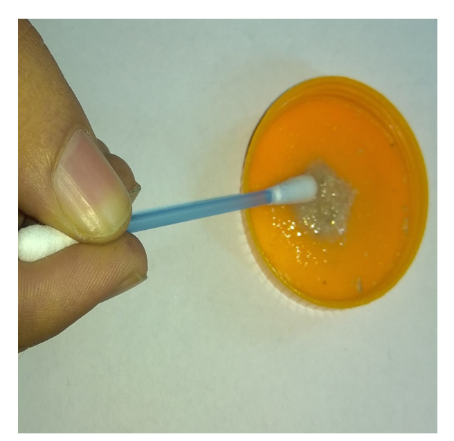
Figure 2b. A paste can be made with the addition of distilled water.