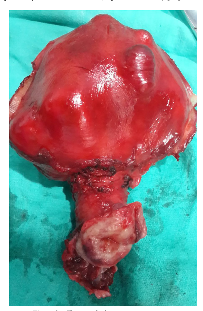
Figure 2a. Showing the hysterectomy specimen.

Laparoscopic surgery performed by a skilled surgeon is considered the gold standard. The extent of resection is individualized. Most authors agree on superficial resection of the nodule or full disk resection of the rectal wall in case of a single nodule less than 3 cm in diameter, if bowel involvement is less than half its circumference. Bowel resection is indicated if it is not possible to resect the nodule or in cases with Adamyan stage IV, between 60 and 100% of such patients show symptom improvement [16]. Therefore; surgical en-bloc resection is the most efficient technique for treatment of obliteration of the cul-de-sac regardless of the route-as the technique used during laparotomy in the current case (Figures 2a and 2b) [17].