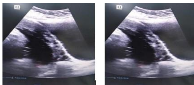
Figure 1. Velvety sign images vesical serosa 2D.

Main ultrasound finding in order of frequency are lacunar beds in all cases. Followed by Doppler color turbulent flow that included bladder serosa line and absent clear zone in the hysterorraphy site (Figures 1-3). In all cases it was observed by ultrasound fine lines like velvety hair were noticed between the placenta and serous bladder distorting the line of the bladder serosa. Surgical macroscopic finding is bladder serosa distorted with marked vascularization and tortuous vascular network. In all case is active red code. Multidisciplinary team participation. Blood loss during cesarean delivery was 2000 ml. All case they needed blood transfusion average four globular packages.