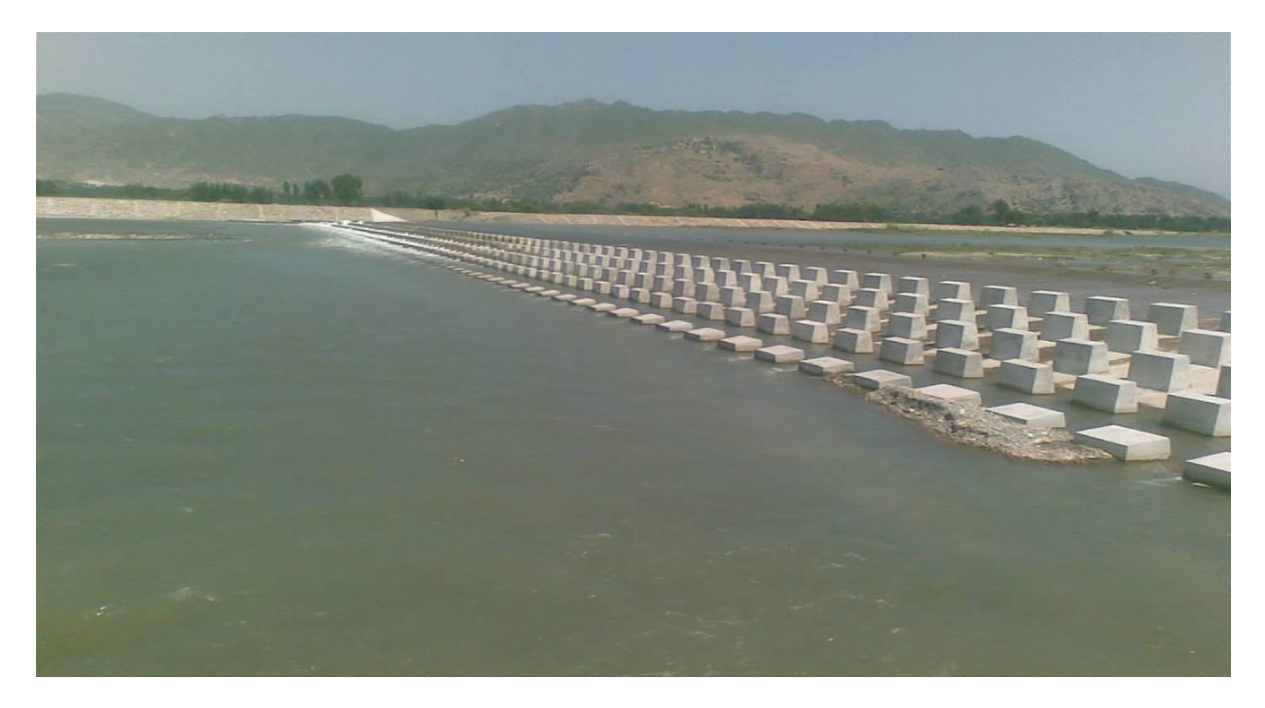
Figure 2. River Swat at Batkhela, District Malakand.