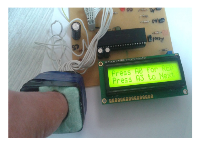
Figure 2. Designed probe and device.

Basically, the designed device uses light to measure oxygen saturation level. Two LEDs emit light at two different wavelengths at the device's probe which illuminates the tissue and the detector behind the tissue detects the absorbed light. When a finger is placed between LEDs and detector, some amount of light reaches to detector which causes device to measure the oxygen saturation level and blood pressure. Based on these measurements, the physical condition of persons can be determined.