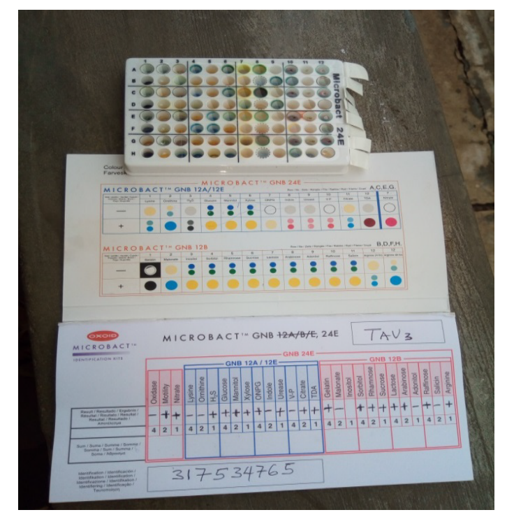
Figure 2. Used Microbact<sup>™</sup> 24E test strip with its report form.

UK) using 10<sup>4</sup> normal saline dilution of a 24 hours broth culture (Figure 3). The results were interpreted according to the Clinical Laboratory Standard Institute (CLSI, 2016) guidelines and the diameter of zones of inhibition measured and recorded in millimeter. The choice of antibiotics was based on their mechanism of action on bacteria and also on the principle of the commonly prescribed antibiotics in Nigeria's Tertiary Health Institutions. The standard antibiotic discs (Oxoid, UK) used with their concentrations include Ceftazidime (30 \mu g), Cefoxitin (30 \mu g), Cefotaxime (30 \mu g), Amoxycillin+Clavullanic acid (30 \mu g), Cotrimoxazole (25 \mu g), Ofloxacin (5 \mu g), Imipenem (10 \mu g), Piperacillin/ Tazobactam (110 \mu g), Cloxacillin (5 \mu g), Oxacillin (1 \mu g), Piperacillin (100 \mu g), Meropinem (10 \mu g), Vancomycin (30 \mu g), Teicoplanin (30 \mu g) and Nystatin (100 IU) (Figure 3).