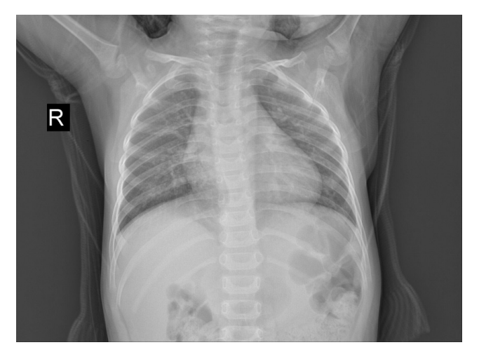
Figure 3. No pleural effusion was detected and no abnormalities were found at the child's 1 year follow-up appointment.

After surgery, no pleural effusion was detected and no abnormalities were found at the child's 1 year follow-up appointment (Figure 3).