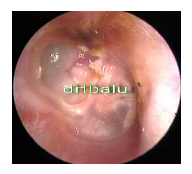
Otoendoscopic picture of attic perforation