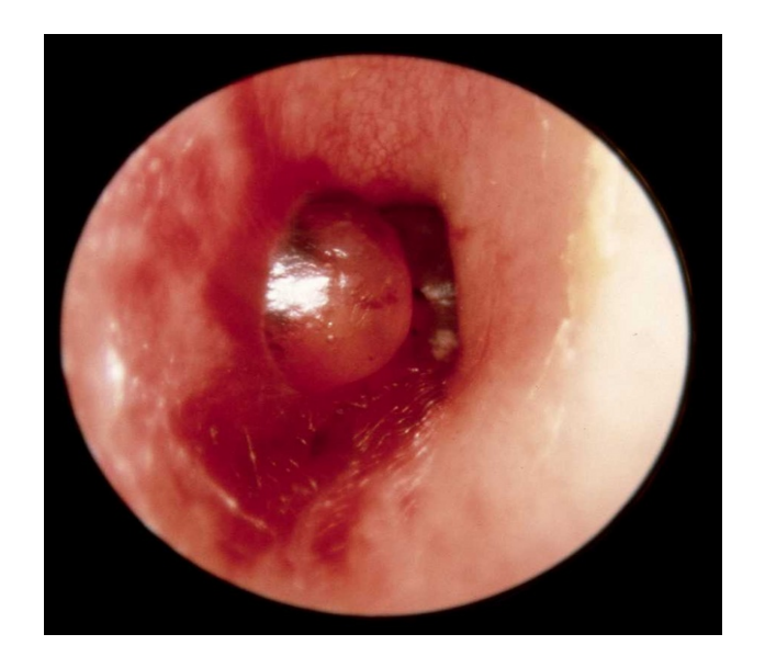
Otoendoscopic picture of acute otitis media