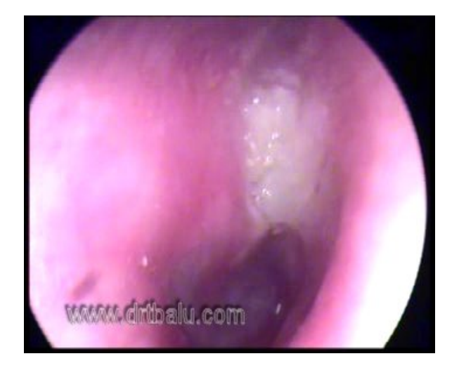
Otoendoscopic view of attic cholesteatoma