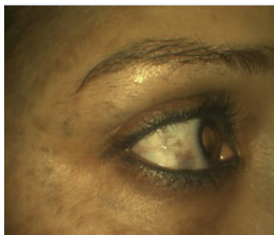
Figure 1. Clinical examination finds patches of blue-slate color in the skin (in the territory of the first branch of the trigeminal) and in the sclera.

This is a 42-year-old patient who consults for a change of optic correction, for whom the systematic examination reveals a sectoral iris heterochromia evolving since her childhood and which increases discreetly in size, according to the patient. Clinical examination finds patches of blue-slate color in the skin (in the territory of the first branch of the trigeminal) and in the sclera (Figure 1). The iris presents a sectoral hyperpigmentation ranging from 6 hours to 1 hour (Figure 2). This makes it possible to make the diagnosis of sectoral oculodermal melanocytosis. Intraocular pressure is normal. At the back of the eye, bilateral papillary excavation at 3/10 is noted.