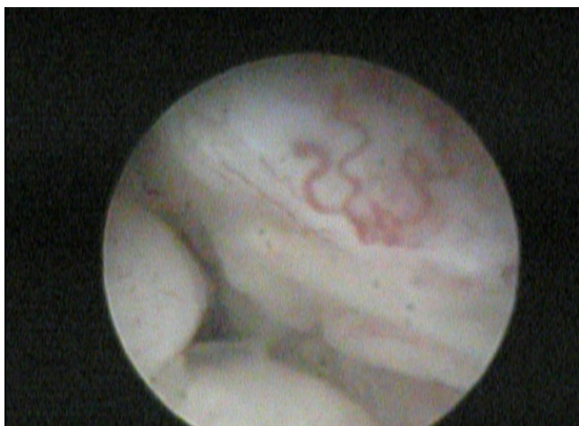
Figure 2. Hysteroscopy Intra Neoadjuvant Chemotherapy.

The long term follow up of the oncologic and fertility results as well as the survival rates were analyzed. Survival curves were estimated according to the Kaplan Meier method.