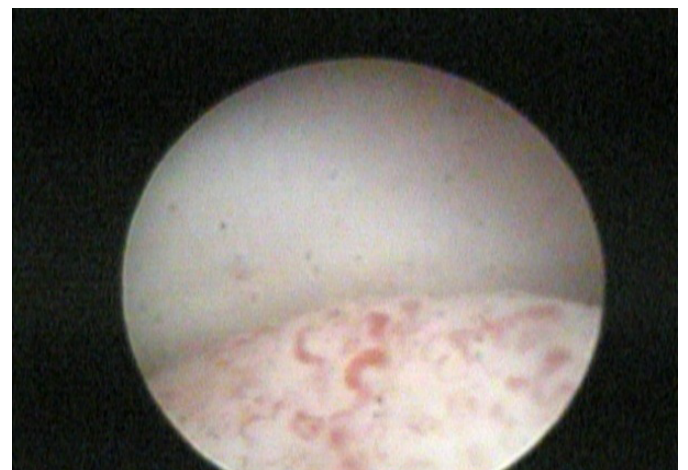
Figure 1. Hysteroscopy Pre Neoadjuvant Chemotherapy.

Radical trachelectomy may be performed using two different approaches; the vaginal approach, with laparoscopic lymphadenectomy, first reported and promoted by Dargent et al. [3] and used by many schools and the abdominal approach reported by Ungar et al. (Figure 2) [4].