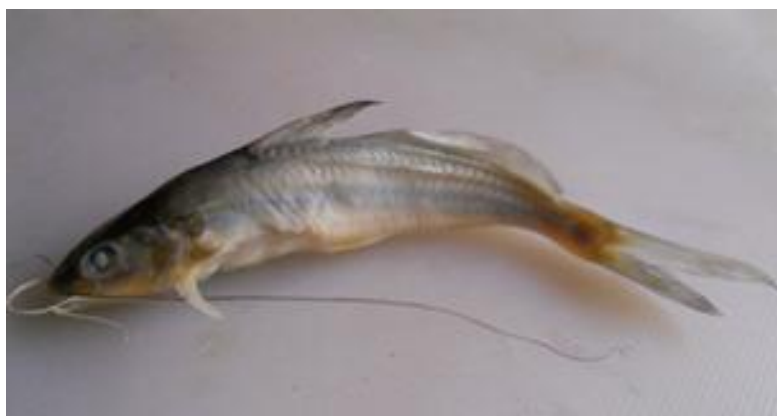
Figure 6. Freshly collected Mystus cavasius , ZSI FF 4930, River Ganges, West Bengal.