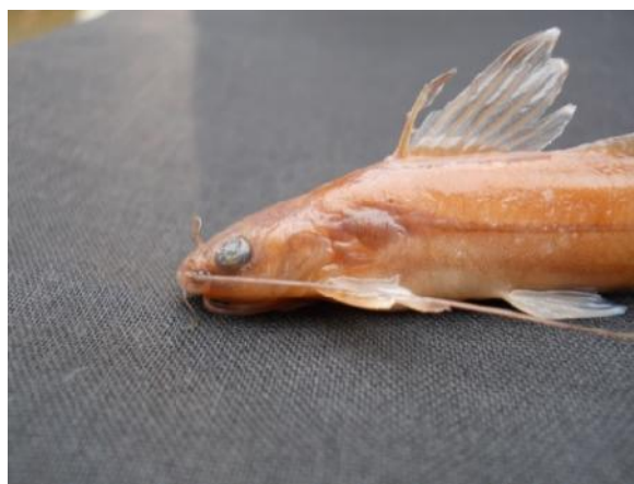
Figure 4. Head- lateral view.

Distribution: Currently known only from the type locality in Kerala.