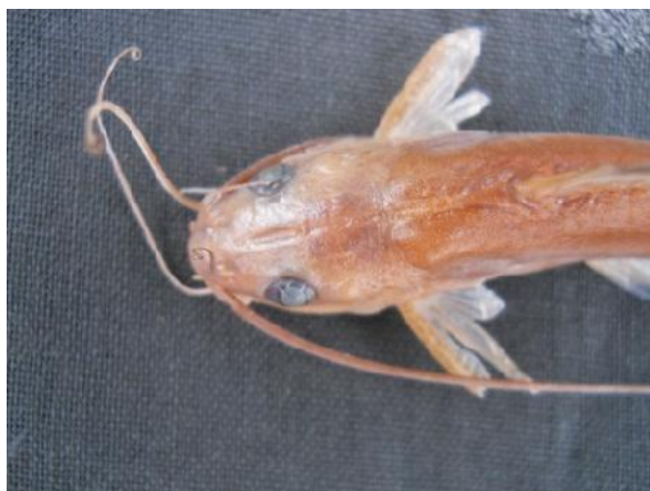
Figure 3. M. keralai head- dorsal view.

Rayed dorsal fin originates considerably behind the origin of the pectoral and fairly in front of pelvic origin; it is higher than the body; its tip not filamentous. Rayed dorsal fin with one spine and seven branched rays; spine ossified but weaker, its outer margin smooth and inner margin feebly serrated. At the base of rayed dorsal fin a ‘<’ shaped small ridge present. Adipose dorsal base fairly long, commencing a little behind rayed dorsal fin and above the origin of pelvic fin. Pectoral fin with one spine and eight branched rays; spine strong, outer margin smooth, inner margin strongly serrated with 12-13 teeth. Pectoral tip never reaches ventral; Ventral fin with one unbranched and five branched rays, located just below the posterior base of rayed dorsal fin, its tip reaches nearly below middle of adipose dorsal and just in front of anal fin origin; Anal fin comparatively longer, provided with four undivided and nine branched rays; it never reaches base of caudal fin.