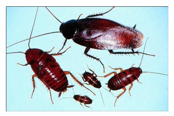
Figure 7. Smokybrown cockroach (Periplaneta fuliginosa).

Smoky brown cockroach (Periplaneta fuliginosa): Smoky brown cockroaches are about 30 milli metres long, a shiny dark brown-black color and fully winged. Egg cases contain up to 26 eggs and are dropped or glued to surfaces. When hatched, nymphs take 6-12 months to develop to adulthood. Adults live for 6-12 months, during which time females produce up to 17 egg cases. Smoky brown cockroaches are susceptible to losing moisture through their cuticle, and so are usually found in damp, dark, poorly ventilated environments. They rarely infest the dwelling parts of buildings, and are instead found in sheds, wall and roof voids, subfloors, mulched areas, in and around grease traps and in drains. They prefer food of plant origin, and are therefore often a pest in greenhouses, nurseries and gardens. They can fly short distances in warm weather, and are often attracted to lights at night [7] (Figure 7).