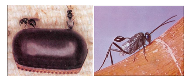
Figure 14. Ensign Wasp (Evaniidae family).

Biological control using ensign wasp ( Evaniidae family): This wasp is considered as parasitoid of ootheca (Figure 14).