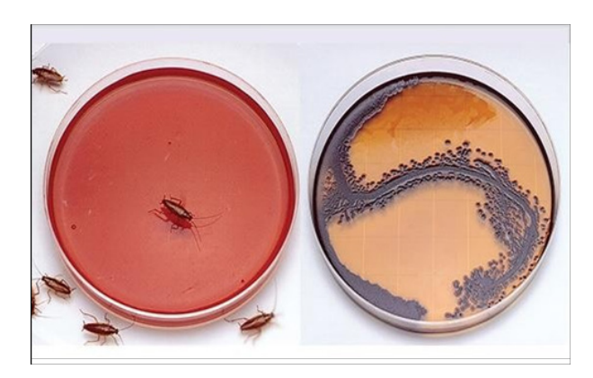
Figure 8. Escherichia coli infection by cockroaches.