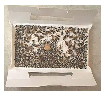
Figure 12. Sticky trap (glue boards).

Cockroach control: The first step in addressing any cockroach problem is sanitation. This means doing a thorough cleanup to remove sources of food, water, and harborage. Be especially careful about things like paper bags, cardboard boxes, and other refuse that can provide roaches with a protected place to live. Ensure foods are stored in containers with close fitting lids, and promptly clean and remove spillage, crumbs and waste. This will increase cockroach activity and movement making them more likely to encounter insecticides. Cockroaches like warm, moist environments. Keep food rooms well ventilated. Ventilation accelerates dehydration of the insects and interferes with the operation of their antenna (Figures 12 and 13).