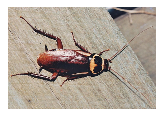
Figure 6. Australian cockroach (Periplaneta australasiae).

Smoky brown cockroach (Periplaneta fuliginosa): Smoky brown cockroaches are about 30 milli metres long, a shiny dark brown-black color and fully winged. Egg cases contain up to 26 eggs and are dropped or glued to surfaces. When hatched, nymphs take 6-12 months to develop to adulthood. Adults live for 6-12 months, during which time females produce up to 17 egg cases. Smoky brown cockroaches are susceptible to losing moisture through their cuticle, and so are usually found in damp, dark, poorly ventilated environments. They rarely infest the dwelling parts of buildings, and are instead found in sheds, wall and roof voids, subfloors, mulched areas, in and around grease traps and in drains. They prefer food of plant origin, and are therefore often a pest in greenhouses, nurseries and gardens. They can fly short distances in warm weather, and are often attracted to lights at night [7] (Figure 7).