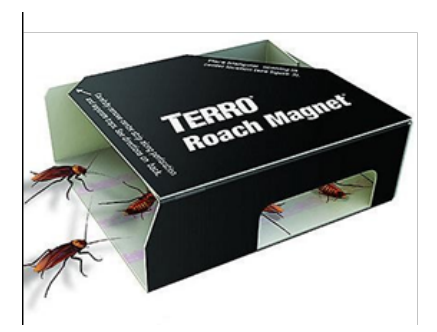
Figures 13. Pheromone trap.

Chemical treatment: After sanitation and population reduction, chemical treatment should be used to kill off the remaining roaches.