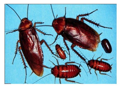
Figure 2. American Cockroach (Periplaneta americana).

American cockroach: Periplaneta americana is large roaches, ranging in length up to an inch and a half. These are the roaches that people usually are talking about when they say "You could have put a saddle on it. They prefer dark, moist, warm areas. They are commonly found in basements, steam tunnels, boiler rooms, rubble foundations, and similar places. Often they aren't even noticed until a light is turned on, and they scurry away rapidly. Both sexes have working wings and at least some flight capability, but oddly enough, they seldom fly [3] (Figure 2).