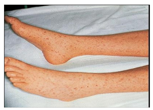
Figure 10. Typhoid transmitted by cockroaches.