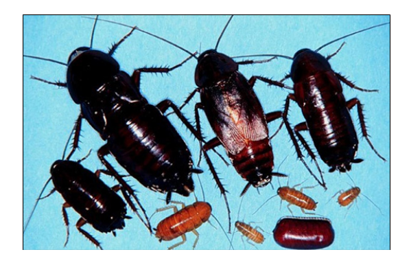
Figure 4. Oriental Cockroach (Blatta orientalis).

Oriental cockroach: Blatta orientalis is black or very dark brown in color and roughly an inch in length. Adult male wings reach about three-quarters down their abdomens, but they cannot fly. Adult females have only small wing pads. They tend to live outdoors when the weather is warm, but they readily move inside during extremes of heat, cold, or drought. They can commonly be found in garbage storage areas, basements, and under porches and decks. They're often found along sill plates in unfinished basements and crawl spaces [5] (Figures 4 and 5).