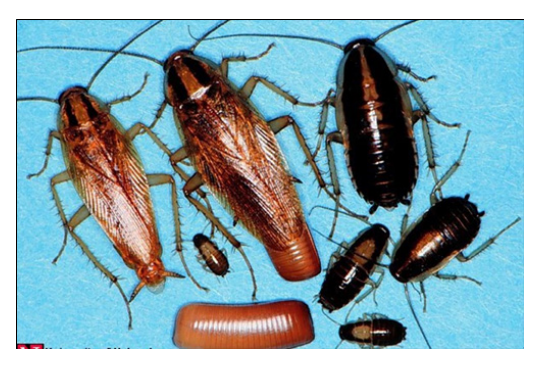
Figure 1. The German Cockroach (Blattella germanica).

German cockroaches prefer warm, moist areas, and are frequently found in kitchens and bathrooms. Thousands of German cockroaches can occupy a single kitchen. A female German cockroach carries an egg capsule containing around 40 eggs. She drops the capsule prior to hatching, though live births do rarely occur. Development from eggs to adults takes 3-4 months. Cockroaches live up to a year. The female may produce up to eight egg cases in a lifetime; in favorable conditions, it can produce 300-400 offspring [1,2] (Figure 1).