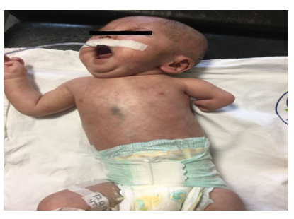
Figure 1. Child physical Examination

The female neonate was delivered at 37th gestational week with a reported birth weight of 2100g by a 24 year-old healthy mother as her second child. Immediately after birth baby was admitted to neonatal intensive care unit due to respiratory distress. Her physical exam revealed left lowset ear and left upper limb deformity with thumb anomaly (Figure 1). We could not confidently identify the left lung parenchyma on chest X-ray. Therefore, we requested chest CT scan, and demonstrated left pulmonary agenesis (Figure 2). In addition, echocardiography showed left pulmonary agenesis and large subarterial ventricular septal defect (VSD); and abdominal US showed right renal agenesis. The parents did not have a consanguineous relationship, and the patient's sister was healthy. Chromosome analysis was normal (46, XX). Taken together, we diagnosed the patient with LACHT syndrome. The patient had normal renal function, and the respiratory distress subsided with