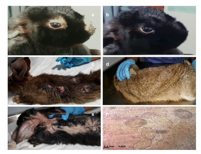
Figure 1. Rabbits infested with S. scabiei var. cuniculi (a) sarcoptic mange in the skin of nose, ears, and around the eye before treatment. (b) Recovery from mange 10 days after treatment with propolis ointment, the skin had no scales and hair growth appeared. (c) Infested rabbit's body surface with S. scabiei before treatment. (d) Recovery 10 days after treatment with propolis ointment in combination with ivermectin. (e) Control untreated rabbits: alopecia all over body surface. (f) Light microscopy of S. scabiei egg detected in scrabing from rabbits treated with ivermectin (x400).

(Figure 2d), and rabbit's skin in 10% propolis ointment with ivermectin (400 \mu g/kg, S/C) treated group showed stratum corneum free from mites (Figure 2e).