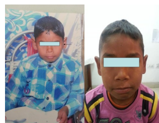
Fig 2 Pre- and post-treatment picture of the patient