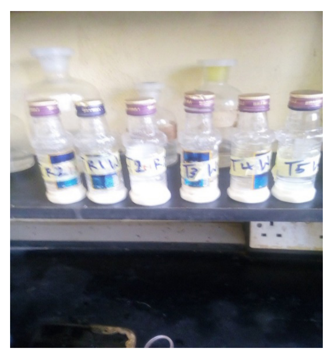
Figure 2. Milk collection.