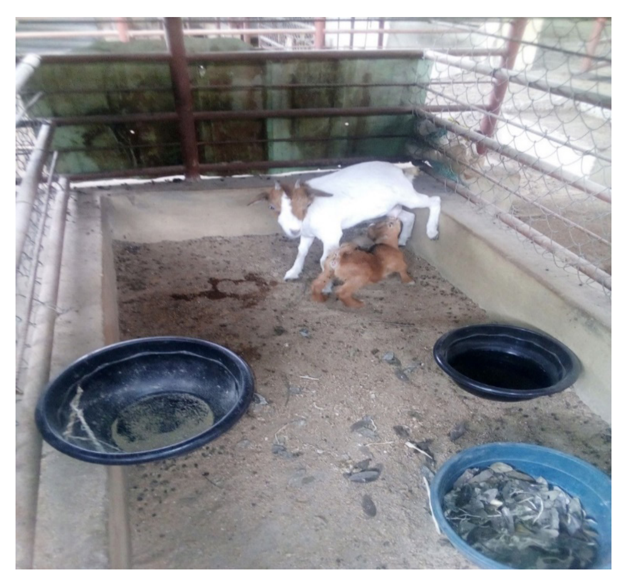
Figure 1. Suckling kid and doe.

Note: <sup>abc</sup> Means on the same row with different superscripts are significantly different (P<0.05). Diet 1: 0% cocoa pod, 60% cassava pulp and 40% acacia leaf; Diet 2: 5% cocoa pod, 55% cassava pulp and 40% acacia leaf; Diet 3: 10% cocoa pod, 50% cassava pulp and 40% acacia leaf; Diet 4: 15% cocoa pod, 45% cassava pulp and 40% acacia leaf; Diet 5: 20% cocoa pod, 40% cassava pulp and 40% acacia leaf.