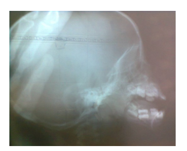
Figure 1: Plain radiograph of the post nasal space showing soft tissue shadow in the roof of the naso-pharynx completely obscuring the naso-pharyngeal air way

However, on curetting the post nasal space we incidentally found a whitish plastic tube like material measuring about 0.5cm in length among the adenoid tissue. Figure 2 shows the foreign body displayed with the adenoid and tonsil tissues. Post operatively, the patient was managed with antibiotics and analgesics and was discharged home the following day to continue management on outpatient basis.