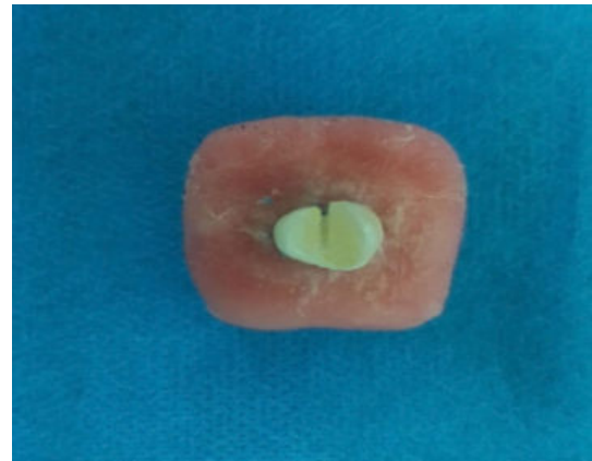
Figure 1. The embedded tooth.