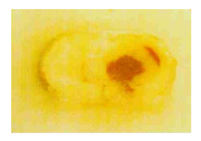
Figure 1. Hemorrhage of right caudate nucleus in mice.

There were no obvious changes and hematoma in the brain tissues of the normal control group. In the model group, there were different degrees of destruction and edema in the cerebral hemorrhage area and its surrounding brain tissues (Figure 2).