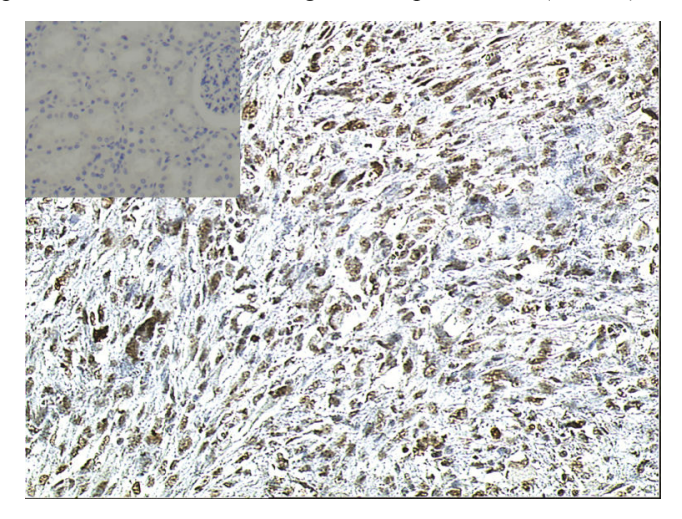
Figure 2. Diffuse and heterogeneous nuclear p53 positivity of the tumoral cells in a case of renal angiomyolipoma containing dominant smooth muscle component. Inset: There isn't p53 positivity of normal renal tissue. (immunohistochemistry, X100).

PAS staining revealed rare intracytoplasmic crystals in all of the tumor tissues. Immunohistochemically, the spindle cells in all tissues exhibited positive cytoplasmic reaction for smooth muscle actin. However, desmin immunoreactivity was detected only in two cases. HMB-45 immunoreactivity was observed in some epithelioid and spindle cells. All tumor tissues were positive for vimentin and negative for pan-keratin (Table 2).