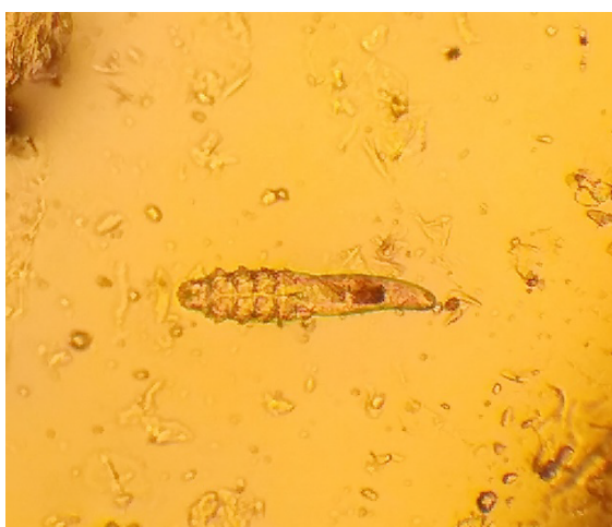
Figure 1. Presence of adult Demodex spp. mites in skin scrapings (40X).

Demodicosis was diagnosed in the clinical samples collected by different procedures including skin scrapings (Figure 1), trichogram (Figure 2) and impression smears (Figure 3) in all the dogs. Dogs with moderate to severe disease, trichogram examination are a sensitive procedure. But, a negative hair pluck does not exclude demodicosis and should be followed by deep skin scrapings. Dogs with superficial demodicosis due to