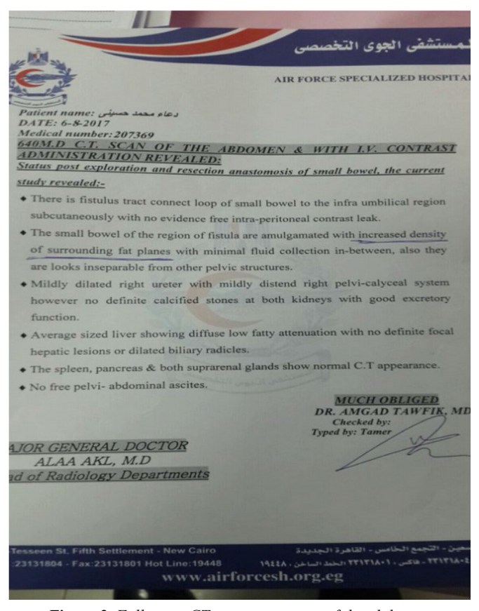
Figure 2. Follow up CT scanning report of the abdomen.