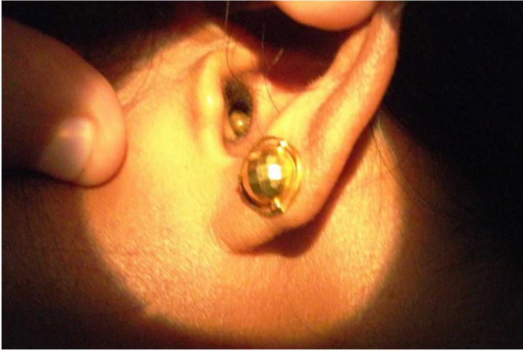
Figure 1 showing Tick in the external auditory canal