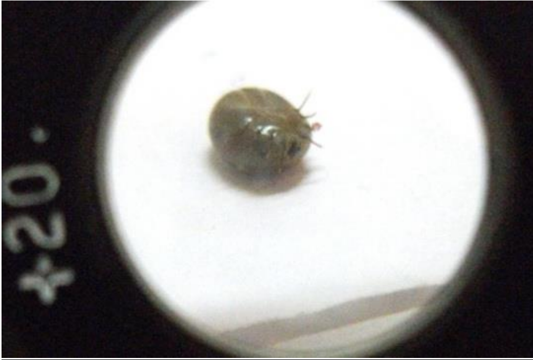
Figure 3 showing tick under low magnification