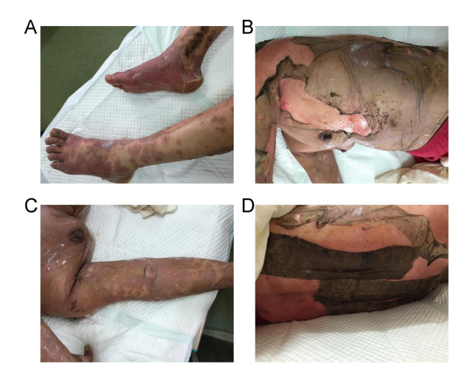
Figure 2. One week of hospitalization. The mucosa lesions involved even the whole body, accompanying with obvious exudation and the extensive erosion and denudation. A. Foot. B. Chest and abdomen. C. Arm. D. Back.

According to the blood test and the laboratory examinations results, among the blister fluid mono-nuclear cells, 55% had the granularity and size of lymphocytes in this case. The most dominant phenotype for the above lymphocytes were CD8+, CD3+, and most of the cells co-expressed the CLA and HLA-DR. Meanwhile, the immunological examinations were also performed to find the immunological disease or auto-immune diseases, and we have not found the associated immune diseases in this patient.