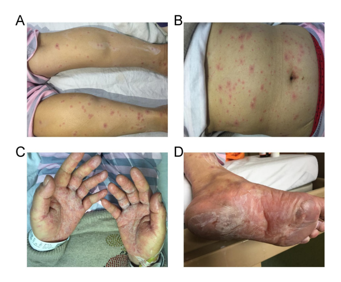
Figure 1. The first day of hospitalization. The patient progressed of erythematous, maculopapular rash all over the body. A. Leg. B. Abdomen. C. Hand. D. Foot.

haematological investigations were deranged. There were hypoproteinemia, hyponatraemia, hypochloraemia and hypokalaemia. Serological tests for HIV, HBV, HCV and TPHA were negative. The allele HLA-B*5901 was detected positively in this patient using the PCR of Sequence-Based Tying (PCR-SBT) method.