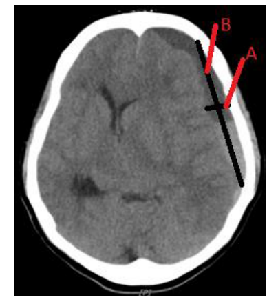
Figure 1. CT Brain Chronic Subdural Hemorrhage.

We retrospectively studied total of 34 patients with Chronic Subdural Haemorrhage diagnosed by CT scan (Figure 1), that were treated surgically in our center between January 2013 to December 2016. All patients underwent drilling of one burr hole and irrigation of the CSDH, followed postoperatively by closed system drainage using silicone catheter size 8 Fr [7-9]. The position of the tip of the catheter was placed in the frontal region. CT scan brain was done after day 2-3 post operation and volume of the CSDH pre and post-operative were calculated as