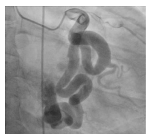
Figure 1. Coronary angiogram showing a dilated left circumflex (Cx) artery with first obtuse marginal branch (OM1). There appears to be a fistulous communication with the right atrium or coronary sinus.

Based on the progression of patient's symptoms and the available diagnostic findings, decision was taken to electively perform a surgical correction of the fistula. An intraoperative TEE showed a markedly dilated coronary sinus with brisk arterial flow (Figure 3).