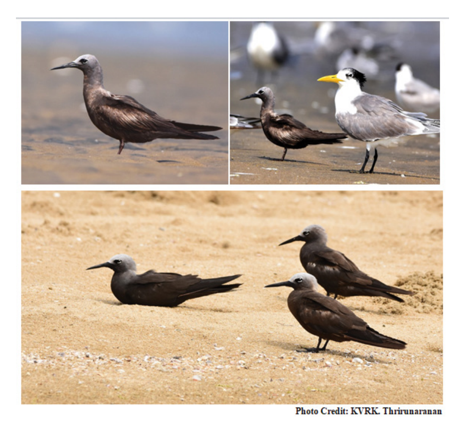
Figure 1: Lesser Noddy recorded from Pulicat Lake, Chennai, Tamil Nadu, India.