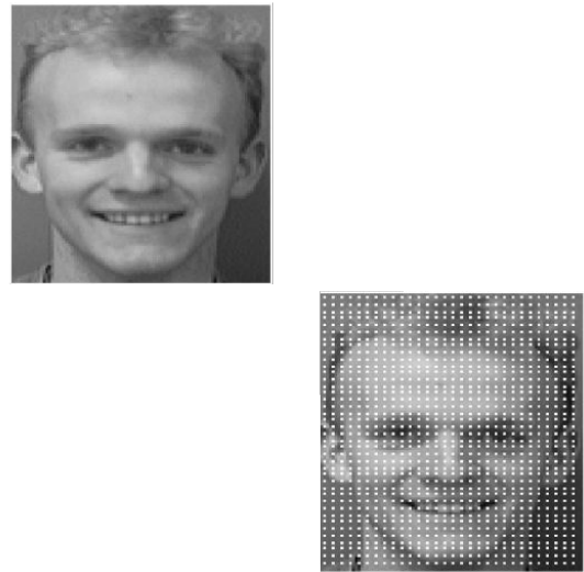
Figure 2. The scanning process of face.

time. For those who do not meet the requirements of the identity, it can quickly identify and refuse these personnel, thereby ensuring the security and confidentiality of the region. The following Figure 2 shows the process of face scanning.