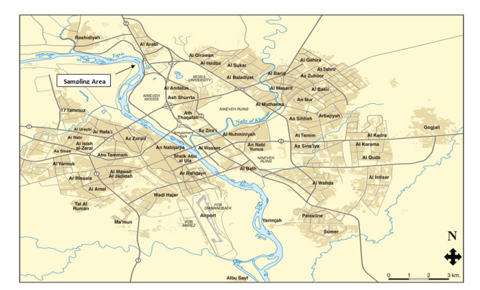
Figure 1. A map of mosul city showing the location of sample collection at the right coast.

In order to achieve the objectives of the study, samples were collected from a part of the Tigris River within the city of Mosul, which were distinguished by the abundance of aquatic plants growing there, as shown in Figure 1, where five species belonging to the genus Potamogeton were collected. They are: Potamogeton crispus , P. perfoliatus , P. pectinatus , P. nodosus and P. pusillus