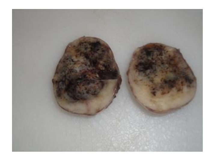
Fig 5 Showing the excised specimen