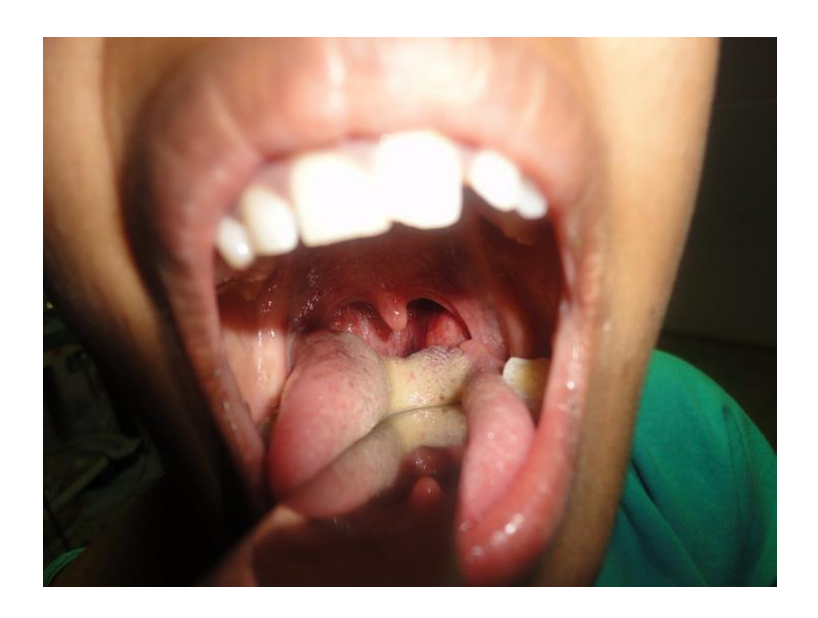
Fig 1 showing the mass pushing the lateral pharyngeal wall on the left side