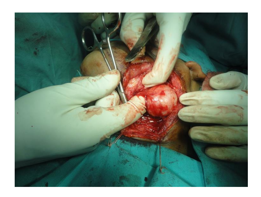
Fig 3 showing swelling being removed