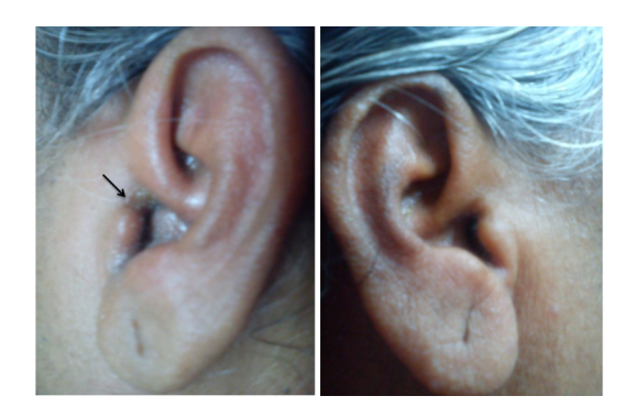
Fig 1: Acute otitis externa of left ear of a female with diabetes, with oedema of ear canal and tragus