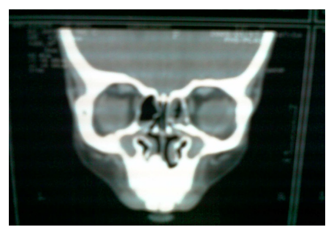
Figure 2: CT-scan which was done following this showed a radio-opaque smooth mass in the floor of the left nasal cavity between the inferior turbinate and nasal septum with a homogenous high attenuation equivalent to that of a tooth

such as cleft palate, rhinogenic or odontogenic infection and displacement as a result of trauma or cyst<sup>2</sup>. Multiple supernumery teeth are rare in individuals with no other associated diseases or syndrome<sup>3</sup>. Males are affected approximately twice as frequently as females<sup>4,5</sup>. Heredity may play a role, as supernumeraries are common in relatives of the affected children.