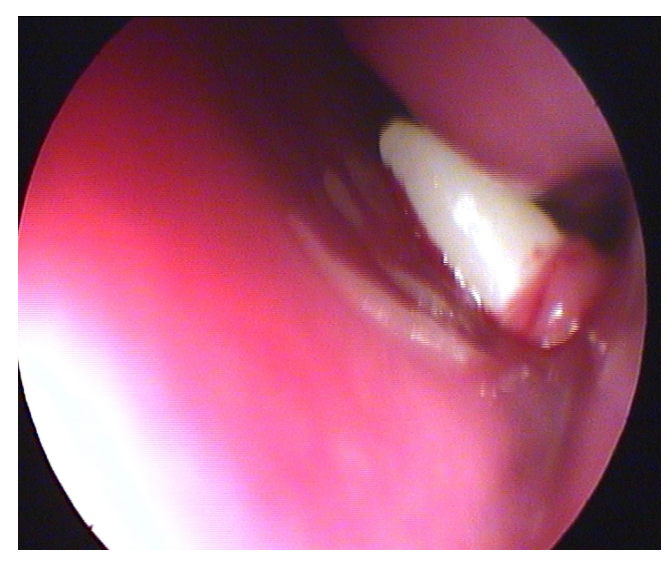
Figure 1: On removing the crusts granulations we seen surrounding the tooth in the nasal floor.