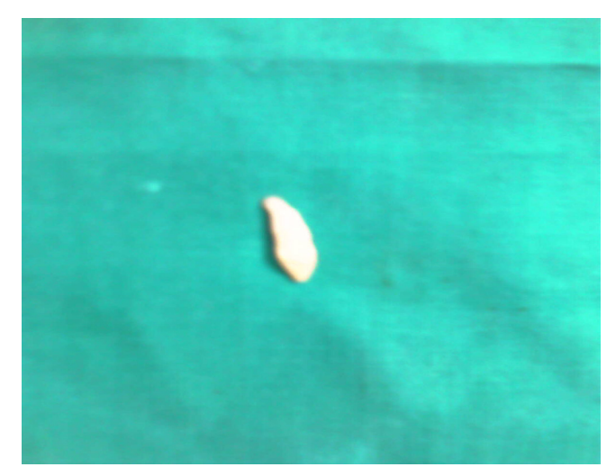
Figure 3: Using a 4 mm, 0 degree rigid nasal endoscope the ectopic intranasal tooth was removed using Luc's forceps

The diagnosis of intranasal is made on clinical and radiological findings. Clinically the patient may be asymptomatic or may present with nasal obstruction, epistaxsis, headache/facial pain, foul smelling nasal discharge, external nasal deformities, nasolacrimal duct obstruction<sup>6,7</sup>. On examination a white mass in nasal cavity is seen surrounded