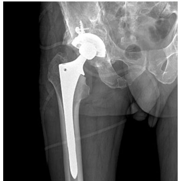
Figure 4. Postoperative X-ray radiograph on January-6-2017 showed good position of prosthesis.

Computed Tomography (CT) image showed internal fixation shadow of the right acetabulum, fair alignment, multiple small bone shadow within the surrounding soft tissues, trabecular structure deformity, increased bone density, hardened edges, and multiple spot-like low density shadow within the femoral head and neck, joint space narrowing in the right hip, and anterior column screw drilling into the acetabulum (Figure 3). The diagnosis was traumatic arthritis of the right hip joint. The patient underwent artificial total hip replacement of the right hip under general anesthesia via posterolateral approach on January 5, 2017. After routine exposing of the hip joint, osteotomy was made on the neck of femur 1.5 cm above the lesser trochanter. Intraoperative observation showed severe