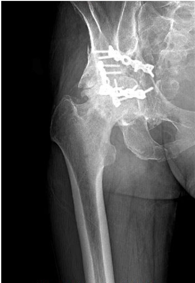
Figure 1. X-ray radiograph obtained showed good alignment, inhomogeneous density of femoral head, femoral neck involvement, joint space narrowing in the right hip, increased density of articular surface, and old fracture of the right ischium.

osteoproliferative edges, and joint space narrowing and blurring in the right hip (Figure 2).