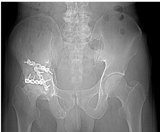
Figure 2. X-ray radiograph showed fair alignment, normal location of the internal fixation, inhomogeneous increase of the density of the right femoral head, femoral neck involvement, osteoproliferative edges, and joint space narrowing and blurring in the right hip.