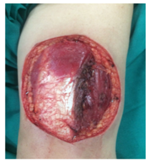
Figure 2. Upper arm defect after excision of the Merkel cell carcinoma tumor.

margins with lymphovascular invasion (pT3NxMx). A Sentinel node biopsy showed no tumor cells. The final size of the defect was 12.5 \times 11.5 cm.