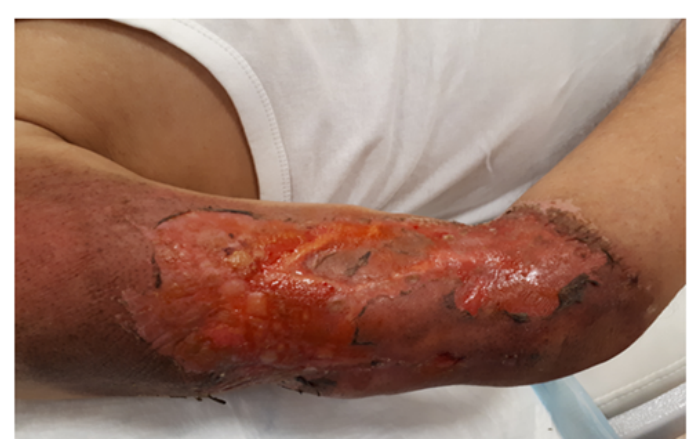
Figure 6. Extensive radiodermatitis lesions with asymmetrical radiation pattern.