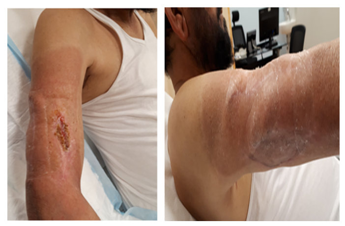
Figure 7 a and b. Cosmetic aspect 5 weeks postoperative after nearly complete healing of the radiodermatitis lesions.

to prevent interruption in the flap perfusion. Dog ear correction can be completed 4-6 months postoperative. A subcutaneous drain was placed and removed when the drainage was less than 25 cc/24 hours (Figure 5). A light compressive non-adhesive dressing was placed on the skin grafts and removed 5 days after the surgery. No pressure was applied on the bipedicled flaps.