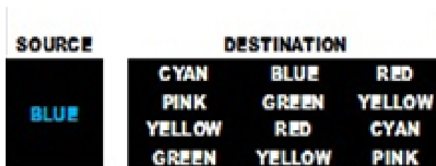
Figure 1. Stroop Colour Test - Stage 1 (ST1): The Source word BLUE is displayed in the blue colour, and the word BLUE in destination list is displayed in white colour. “Congruent-White”.