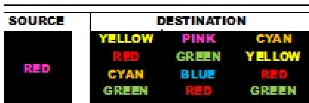
Figure 2. Stroop Colour Test - Stage 4 (ST4): The Source word RED is displayed in pink colour, and in the destination list the word PINK is displayed in pink colour. This is referred to as “Incongruent-Congruent”.

The subject is presented with the stimulus word for duration of 1 second. The stimulus word is followed by the response screen, which is displayed for 3 seconds during which the subject should click on the answer from the options. The time interval of 0.5 second is kept between the two tasks. Thus to complete one stage (ST) a total of 4.5 seconds is required. Each ST is presented twice to the subject, thus the total time taken to complete the low interference stroop sector is approximately 5 minutes. ECG is recorded during the 5 minutes when stroop test is performed. Similarly, for medium interference stroop sector 5 minutes is required and also for high interference stroop sector 5 minutes is required. ECG is recorded during the 5 minutes of medium stroop test and also during 5 minutes of high stroop test period. The baseline measurement (‘No Stress’ sector), ECG is recorded for 5 minutes, and 10 minutes rest period is given between low