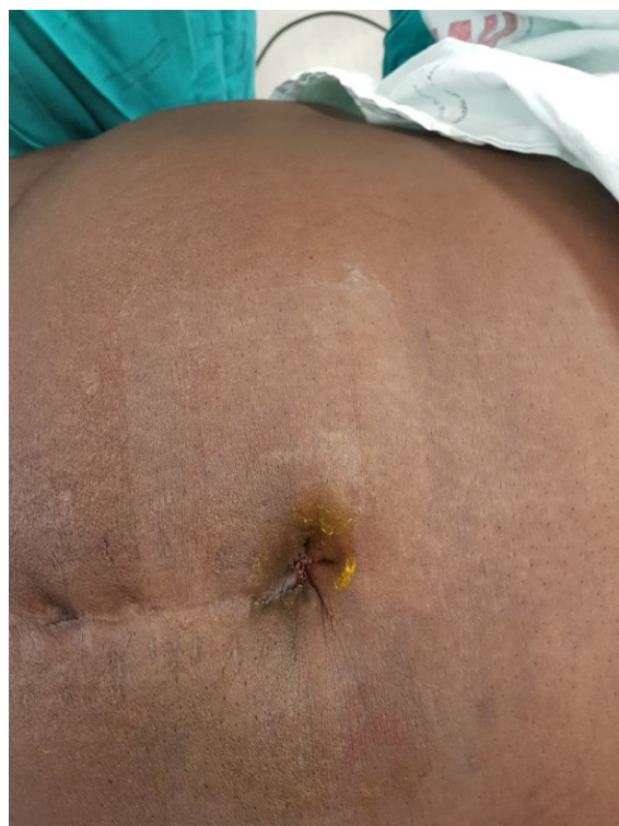
Figure 3. Complete reconstruction of the umbilicus.

wall [4,9]. The possibility of coexisting pelvic endometriosis should be investigated by postoperative follow-up.