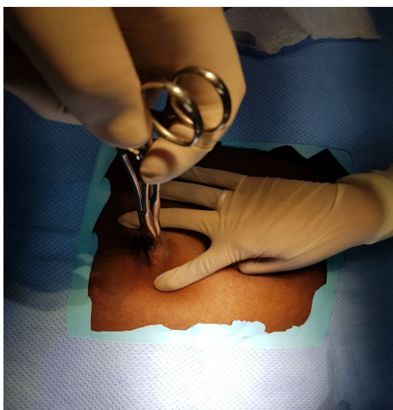
Figure 1. A brown moderately painful nodule of about 2 cm in diameter located deep in the umbilical fold, with signs of recent bleeding.

All the cases in this study underwent complete removal of the umbilicus, with total excision of the endometriosis lesion, obtaining an adequate rim of normal tissue all around in order to avoid local recurrence (Figure 2). Reconstruction of the umbilicus was performed in all cases (Figure 3). One case underwent repair of the underlying fascia and peritoneum. Our study is comparable to other studies [1,4,16-18] that have shown that total excision of the lesion is associated with no recurrence during follow-up. The mean follow-up period for our cases was 36 months. All cases included in the study underwent diagnostic laparoscopy. No pelvic endometriosis was found during diagnostic laparoscopy. This is akin to other authors who have suggested that there is no need of laparoscopic assessment in cases of cutaneous endometriosis of the anterior abdominal