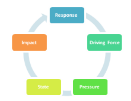
Figure 2. DPSIR methodology.

The Convention on Biological Diversity (CBD) has urged parties to develop national and regional biodiversity targets, using the strategic plan and its global Aichi targets [20]. The Aichi global target emphasis that 17 percent of terrestrial and inland water areas, especially areas of particular importance for biodiversity and ecosystem services are conserved through well-connected systems of protected areas and effective conservation measures. Accordingly, India has developed 12 national biodiversity targets and the target 5 (sustainable management of fisheries); target 6 (ecologically representative areas, especially importance for species, biodiversity, ecosystem services are conserved), and target 8 (ecosystem services related to water, human health, livelihood and wellbeing's are enumerated and measured) are related to inland fisheries [21]. The present study has brought out few recommendations to integrate biodiversity considerations into the inland aquatic system towards increasing the aquatic diversity.